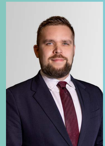
Bence Pintér Mayor of Győr